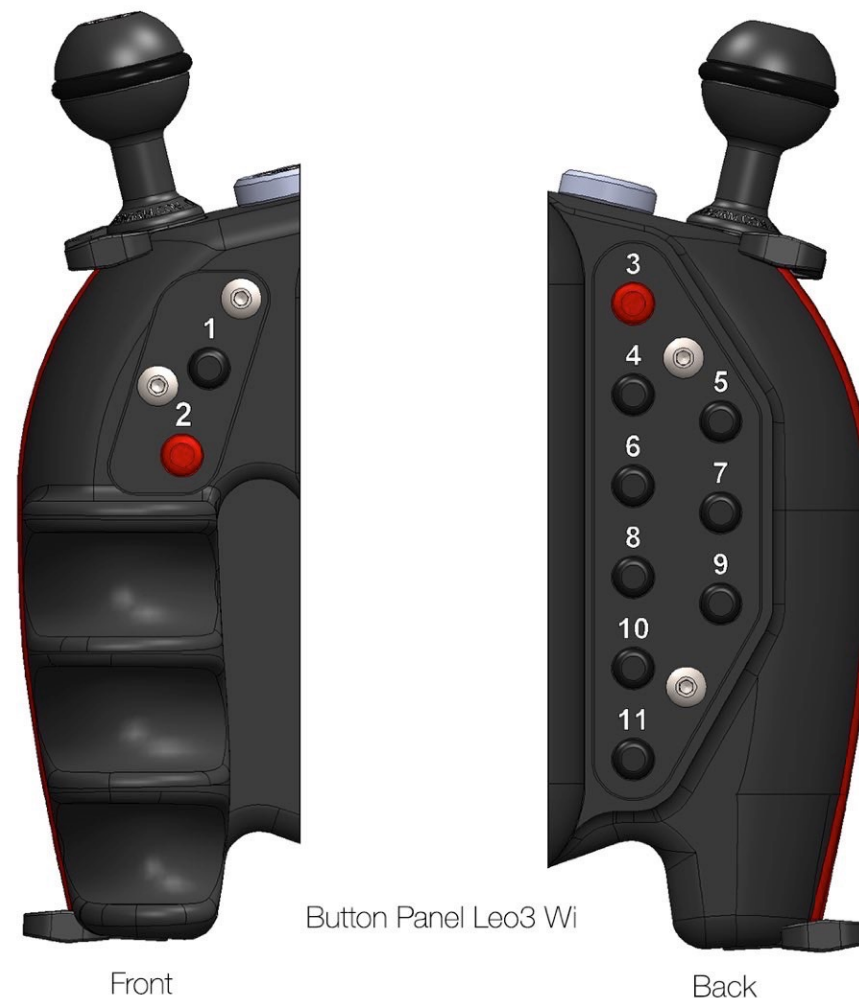
Button Panel Leo3 Wi

* Available video resolutions depend on the camera model.